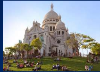
BASILIQUE DU SACRÉ COEUR DE MONTMARTRE